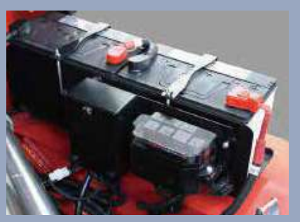
The integrated electrical box can be maintained easily