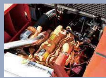
/uchai common rail engine