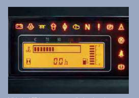
information of the vehicle to facilitate troubleshoot the running status of the vehicle can be monitored